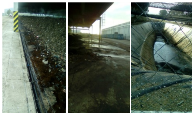
Fig. 1 Leachate generation in waste accumulation areas

Landfills and waste treatment centres generates atmospheric emissions (greenhouse gases) and also a very polluting liquid fraction called leachate (Fig. 1).