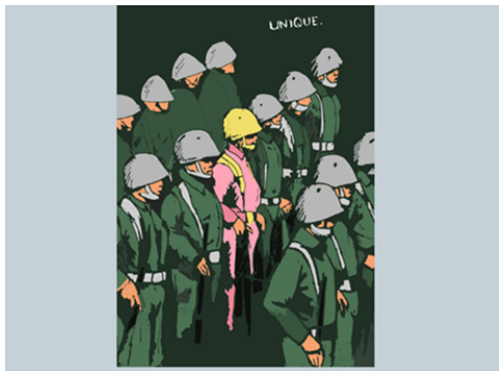
Fig. 3 Student Artwork – Reflection on Personalized Learning