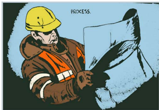
Fig. 4 Student Artwork – Reflection on Process in Learning