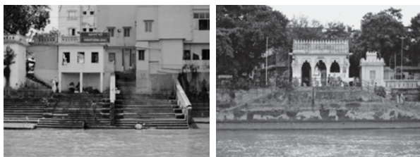
Fig. 5 Public spaces along the west bank, KMA