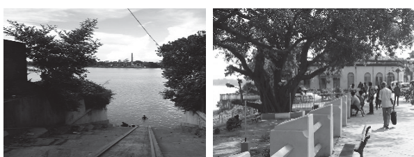
Fig. 6 Public spaces along the east bank, KMA