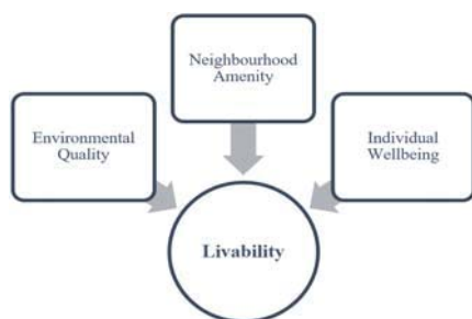
Fig. 2 Dimensions of livability

The concept and principles of livability are important to recognise the significance of community wellbeing [13]. The attributes and dimensions of livability are also important aspects to measure the overall prosperity of that place [17]. Livability potential is mainly the capacity to develop into the overall well-being of an urban area in the future [15].