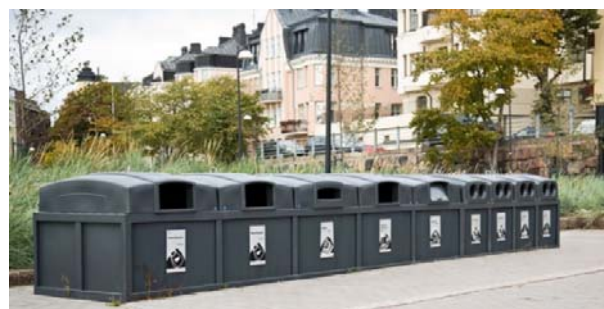
Fig. 3 Collection points

plastic packages as along with the new decree on packaging and packaging waste, the responsibility concerning the collection and recycling of domestic packaging waste is transferred to the producers [8]. The collection of plastic has been started at the collection points this year. Plastic collection has also been piloted at selected residential buildings from spring 2016 on.