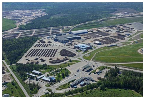
Fig. 1 Ämmässuo Waste Treatment Centre

Other Ekomo project includes the purification of sand used for sanding the roads and pavements. Purified sand can be reused, and the fine fraction separated from sand is utilized in top soil production from compost.