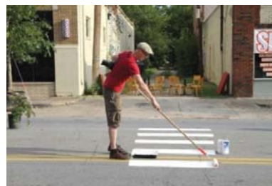
Fig. 3 Better Block Volunteer create new crossing lines in Oak Cliff, USA [16]

The Community-led movement "Build a Better Block" can be presented as an example of an initiative that since 2010 has proposed balancing opportunities among pedestrians and cyclists and motorized vehicles in neighborhoods of North American cities by creating more pleasant and safe areas for walking and cycling, strengthening the notion of community and neighborhood, and encouraging social engagement in urban decisions.