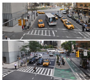
Fig. 2 Experimental phase of interventions creating new areas for pedestrians and cyclists on Broadway, New York [15]

The phase 0 actions, for example, accept their test condition nature and reinforce the relevance of being configured as an experimental stage on the human scale. This initiative refers to one of the main foundations of Tactical Urbanism, namely the Build-Measure-Learn approach and the Design Thinking cycle, whose concepts considered by Lydon and Garcia (2015) have been adapted to Urbanism and value the role of testing actions and the implementation of interactive and low-cost development processes [8]. Thus, these actions demonstrate an open field of possibilities that allows the pre-transformation analysis of space as a way of recognizing its real impacts, so that they can be designed for the long term if they are successful. It is in this phase of study that it is possible to evaluate the effects of such initiatives in real time avoiding expenses and future revisions [9]. Such experiences may indicate new demands or changes in the process as they are implemented. On the other hand, the temporary initiatives in the city can be configured as tactics whose primary characterizing factor is time, having a defined active period,