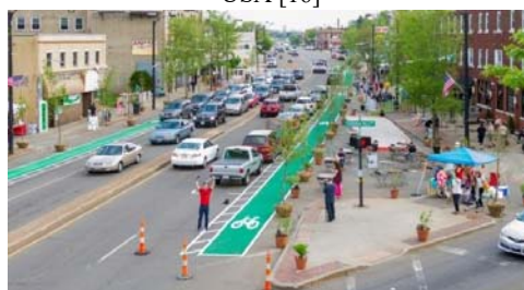
Fig. 4 Bike lanes in North Hill, Ohio, 2015 [17]