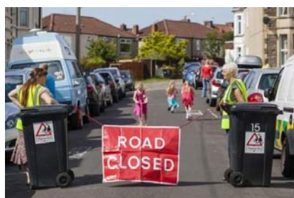
Fig. 7 Playing Out, Bristol, United Kingdom [20]

According to the Urban Street Design Guide, some types of temporary road closures can be highlighted, such as: play streets, pedestrian streets and open streets [9]. Play streets are often considered as extensions of schools or residential areas, delimiting spaces in the pathways for children's cultural and leisure activities. Open and pedestrian streets destine the use of the street for Active Transportation and offer invitations to stay in public space. Thus, two initiatives can be presented that boosted Active Transportation and which have become regular experiences, but have maintained their temporary character. As an example, we have the experience called Playing Out created in Bristol in England and Paulista Aberta in São Paulo, Brazil. In 2011, Bristol City Hall recognized the benefits of temporary road closures by some parents for child's recreational use. This initiative allowed the experience to happen regularly, encouraging other parents to do the same on other streets [8]. In Brazil, 2016, São Paulo City Council officially decreed the regularly temporary closure of Paulista Avenue , which since October 2015 has interrupted vehicular traffic and is open exclusively to the use of Active Transportation modes on Sundays. Both movements claim for safe and comfort spaces for leisure, walking and cycling, encourage the use of alternative transport and rethink the use of motor vehicles in the city.