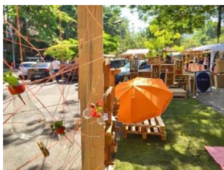
Fig. 11 Temporary parklet, Rio de Janeiro, Brazil [22]

Among the temporary initiatives which aim to encourage Active Transportation and claim for opportunity balance for pedestrians and motorized vehicles, there are assemblies called parklets. The replacement of street parking spaces for the installation of parklets subvert their original use and work as social gathering places and as invitations for people to use the road space which was designed originally for cars. According to the National Association of City Transportation Officials, parking spaces have the potential to host a big range of uses beyond what was originally designed to them and to boost urban vitality [9].