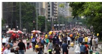
Fig. 8 Paulista Aberta, São Paulo, Brazil [21]