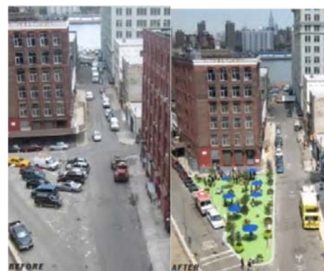
Fig. 10 Before and after the intervention at Pearl Street Plaza [11, p. 5]