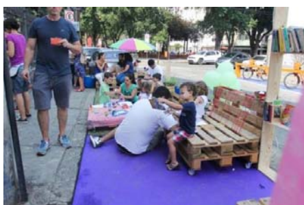
Fig. 12 Park(ing) Day, Rio de Janeiro, Brazil [22]

These sidewalk extensions promote the use of the public space in a democratic way and allow the community to build its own social space, even though temporarily. Some interventions can remain for hours, days, months or years, depending on the action. This is a movement which was initiated in San Francisco, USA, called Park(ing) Day, and aims to denunciate the big offer of space which are designed for cars and to boost city appropriation and social participation. It is important to highlight that, in the past few decades, some Brazilian cities such as São Paulo and Rio de