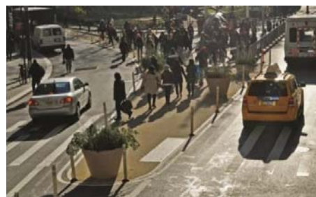
Fig. 5 Pedestrian safety island in New York [18]