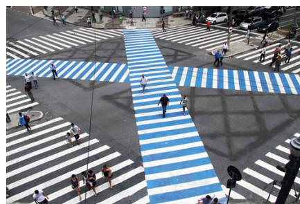
Fig. 6 Optimization of crossing lines proposed by São Paulo City Hall [19]