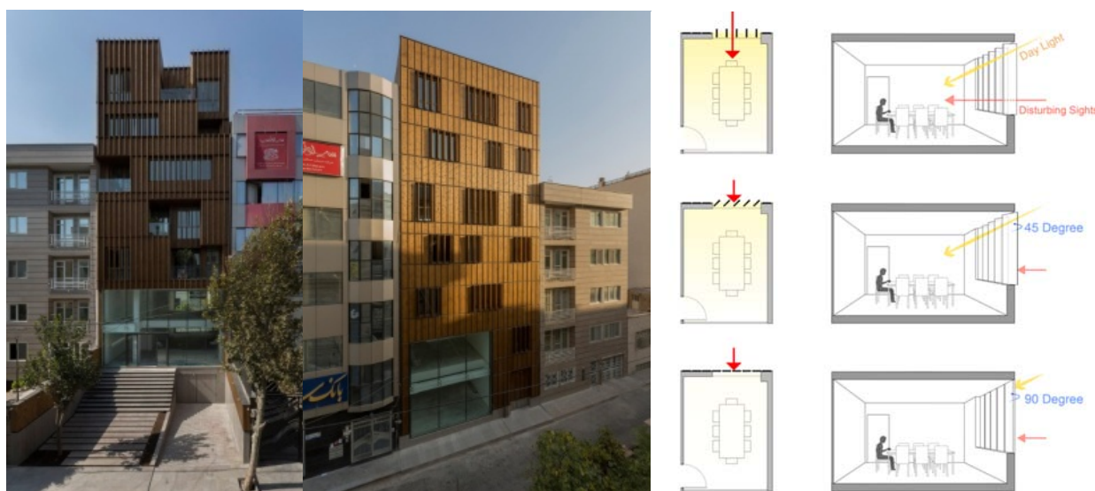
Fig. 7 Saadat Abad Office Building by LP2 Architects [16]