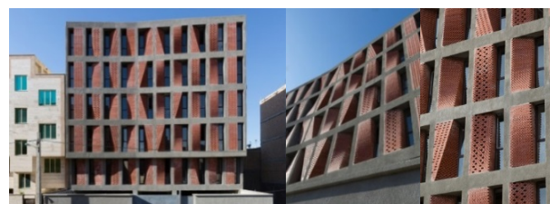
Fig. 1 Kahrizak Residential Building by CAAT Studio [10]

The choice of material is a significant parameter in the sustainability enhancement of this building; because of being locally available, it greatly reduced time, energy, and overall project's cost. Besides that, its arrangement created the high quality interior spaces while minimizing energy consumption.