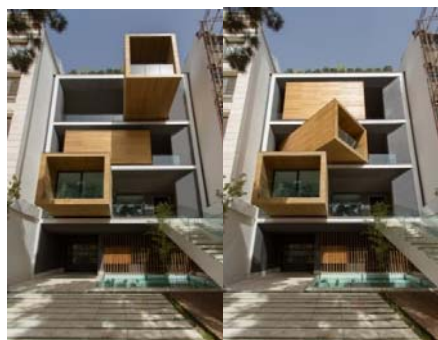
Fig. 3 Sharifi-ha House by Next Office [12]

The main design strategy in this house is the flexibility and transformability of its facade from a two-dimensional facade to a three-dimensional one, which provides a great opportunity for the inhabitants to simply adjust their living environment with the climatic situation of the region to achieve maximum comfort with least amount of energy.