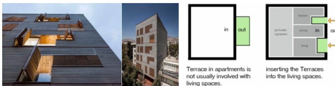
Fig. 2 Andarzgoo Residential Building by Ayeneh Office [11]

In this building, the integration of the terraces into the living spaces together with the utilization of a movable wooden shell was the main design strategies used in the main facade to create comfortable interior spaces while utilising less energy. Moreover, the architects used factory off-cuts of granite for the building's facade, which were laid in strips of varying depths to create a ridged surface; reuse of such waste materials is another sustainability feature in this building.