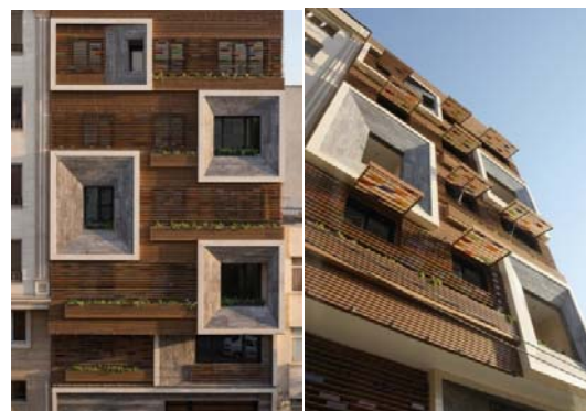
Fig. 5 Orsi-Khaneh by Keivani Architects [14]