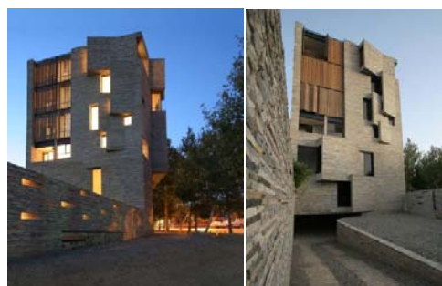
Fig. 4 Apartment No. 1 by AbCT [13]

The main facade of this building is made from a double layer timber, together with panes of stained glass along with planting, that is for aesthetic reason as well as controlling the temperature. Slatted sunshades over the windows can also provide additional control of sunlight. The material used for the large window frames is a type of stone called travertine and their shape assists in reducing heat. The building materials are recyclable and native materials. All these features together would save a considerable amount of energy and enhance the sustainability level of the building.