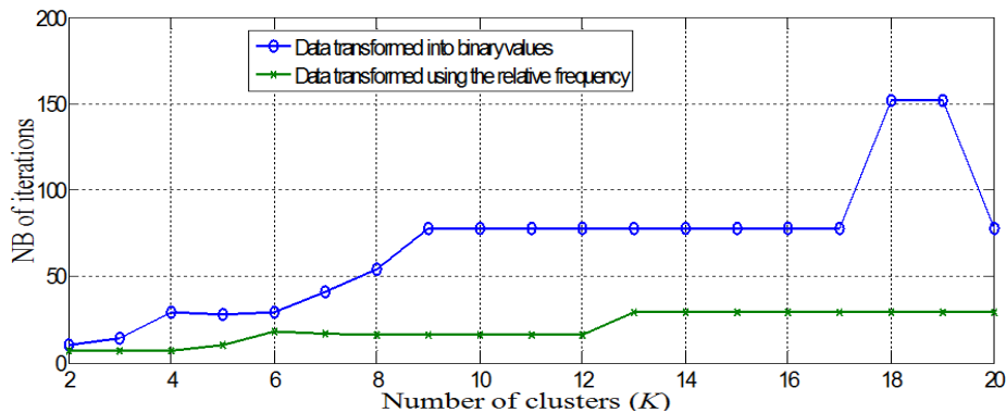
Fig. 2 NB of iterations comparison using the two methods for the considered datasets over the number of clusters

The two previous figures represent the scalability of the k -means clustering algorithm when considering two different initial datasets obtained according to our approach. The scalability is defined by two parameters: the run time and the number of iterations required by the algorithm to converge. According to these two factors, the relative frequency transformation is lower than the run time required by the binary method. This fact highlights the convenience of the proposed approach and the value of our contribution. The difference in the execution time is very significant and makes our proposed approach more adapted for data mining applications when dealing with huge datasets.