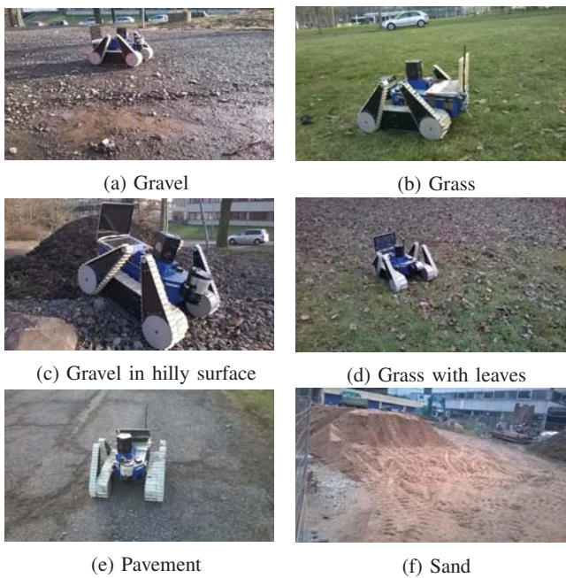
Fig. 2 Examples of various environments for the four outdoor terrain types

The recordings for the sand class had to be stopped prematurely because the sand entered between the belt of the main track and the driving wheel and dislocated the belt. Therefore, the amount of data available for the sand class is much lower than for the other terrain types. For all types except sand, we recorded around 24 minutes of audio, for sand, only a bit more than two minutes.