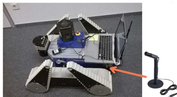
Fig. 1 Microphone Setup on the Robot

For the sound recording, we mounted a laptop onto the robot, equipped it with a small USB sound card (a Sennheiser USB adapter) and used an omnidirectional electret capacitor microphone (Elecom table microphone), which was placed next to the left rear motor and relatively close to the ground, as shown in Fig. 1. The recording was done with standard Linux software (audacity). All audio was recorded in 16 bit mono pulse-code modulation (PCM) with a sampling rate of 11025Hz.