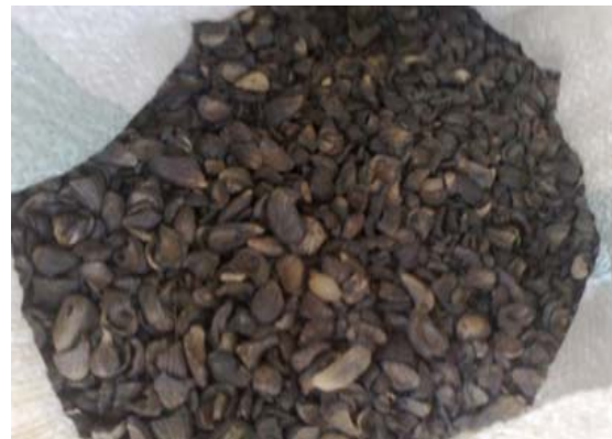
(a) PKS large aggregates

The PKS large aggregate shown in Fig. 1 (a) was obtained from the waste yard of a local palm oil producing company in Ibadan in the southwestern region of Nigeria. The sizes of the PKS large aggregates range from 5mm to 15mm. The PKS large aggregate was thoroughly washed to remove earthen impurities and dried. The sun dried PKS large aggregate was crushed to obtain PKS fine aggregate shown in Fig. 1 (b). Sieve analysis was conducted to determine the gradation (particle size distribution) of the PKS fine aggregate. The bulk densities and the water absorptions of the PKS fine aggregate and that of typical normal weight river sand were determined.