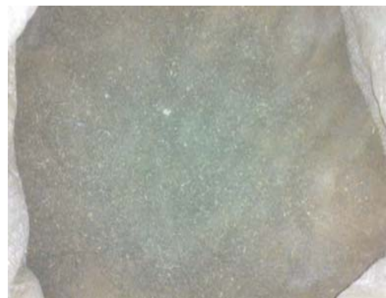
(b) Crushed PKS fine aggregate