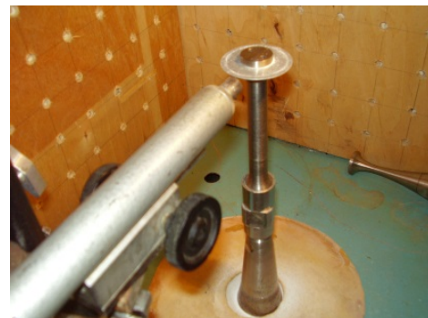
Fig. 1 Graphic image experiment of plate

It is obvious that (1) can be replaced by two equations of the second order according to the method of factorization