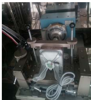
Fig. 4 Motor setting up using dynamo load tester in chamber