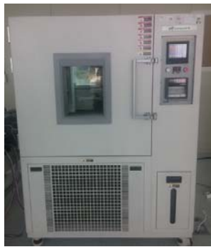
Fig. 3 Environmental (temperature) chamber used for the test