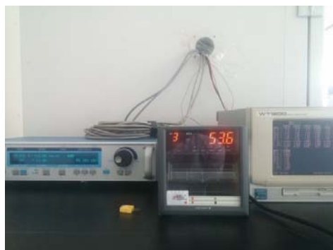
Fig. 5 Measurement of test temperature and load condition

In the case of motors, the stress was selected as the load because the factor that directly affects the stress is the load [4].