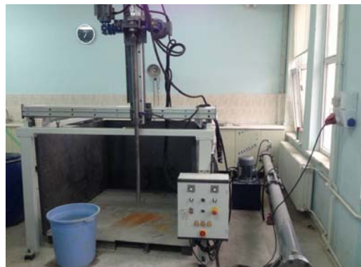
Fig. 1 Mapping nonlinear data to a higher dimensional feature space

capacity of maximum 100 bars injection pressure, 2-30 rpm rotation speed, 5- 100 cm/min rod pulling. The 20 lt injection tank involves the grout mixture prepared by using the required water/cement ratio and jetted into the soil with constant pressure at once.