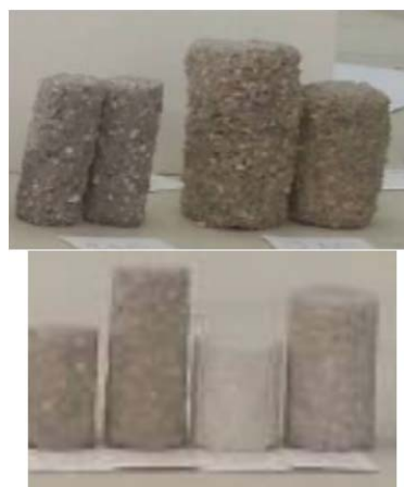
Fig. 6 The preparation process of the core samples

Unconfined compressive strength values were measured after performing unconfined compressive experiments on the prepared core samples. The average diameter, column length and unconfined compressive strengths of the JG columns produced in 3 different combinations are given in Table III.