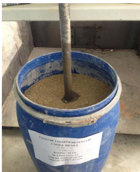
Fig. 3 Placing the sand into the experiment tank and the lowering process of the rod

D_r=0.35 relative density (loose density) (Fig. 3). A sieving process from a specific height was carried out to reach this density. After the sand was placed, the rod was lowered to the tank bottom by rotating.