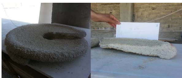
Fig. 7 Effect of Pulling Speed on the Column Performance