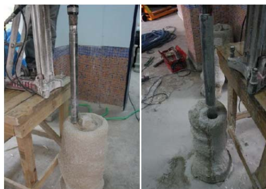
Fig. 5 Taking cores from the columns

The JG columns produced with 3 different combinations of production parameters were taken out of the tank after 28 days, and the unity of the columns were observed after measuring the diameters and lengths of the columns. Cylindrical core samples of 5 cm diameter were taken using a core drilling machine to determine the compressive strength values of the columns (Fig. 5). The core samples were smoothed using a marble cutting machine to prepare the cylindrical test samples of specific diameters and lengths (Fig. 6).