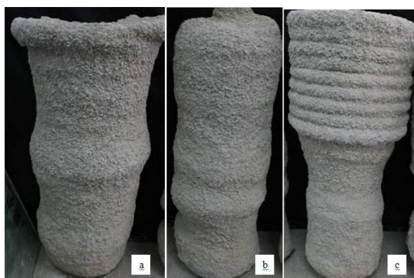
Fig. 4 JG columns produced in (a) 1 st Combination (b) 2 nd Combination (c) 3 rd Combination