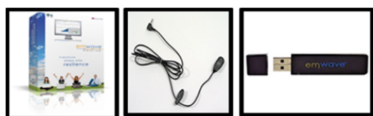
Fig. 1 EmWave kit

Fig. 1 shows the instrument that has been used in this research, the emWave kit. The instrument's function is to act as a controlling device which may help reduce emotional pressure, improve one's internal balance, and increase the energy level and performance of the participant. The instrument is uncomplicated and is suitable to be used anywhere; it is made up of mainly of a USB drive which will be connected to the computer, and a pulse identifier, which can be temporarily clipped to the ear.