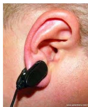
Fig. 2 Ear sensory device