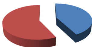
Fig. 2 The rate of ORT among broiler flocks in Fars Province. Blue refer to positive samples and red refer to negative samples

Of the 318 serum samples taken from 15 broiler farms in Fars Province, 135 (42.5%) had positive antibody titers against ORT in ELISA tests (Fig. 1) and 122, or 38.4%, possessed antibody titers of 7 to 10 against NDV in the HI test. Moreover, using the HI method, 61 serum samples (19.2% of the total) included antibody titers against ORT and antibody titers higher than seven against NDV. Of the total tissue samples taken from the poultry farms to isolate the virus through inoculation of eggs with embryos, 20 samples had rapid hemagglutination activities, and six of them were considered Newcastle positive in the HI test using the standard antibody against NDV. Of the 20 tissue samples with positive HI test results, only six samples amplified the 535 bp segment and were identified as samples containing NDV (Fig. 2). It must be mentioned that all samples that were identified positive using the isolation method were also identified as positive in the PCR test. Therefore, considering the disease symptoms and isolation of the virus from the mentioned tissue samples, this virus cannot be a lentogenic NDV and, hence, cannot be a vaccine. Results indicated that, in half (50%) of the poultry farms that had antibody titers against ORT , antibody titers against Newcastle were higher than 7, and results of their NDV isolation and of the PCR test were positive for Newcastle.