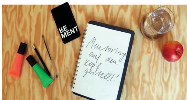
Fig. 2 Reverse-mentoring postcard; German text: "Mentoring turned on its head!"

Besides the organisational issues, one main task of program managers is the promotion of the mentoring program inside and outside school. This can be through the use of flyers, as shown in Fig. 2, presentations for the colleagues and in class, articles for newsletters and blogs or texts in newspapers. Also the official events of the program, the kick-off and the closing event (see below), can be used for the promotion of the reverse-mentoring program.