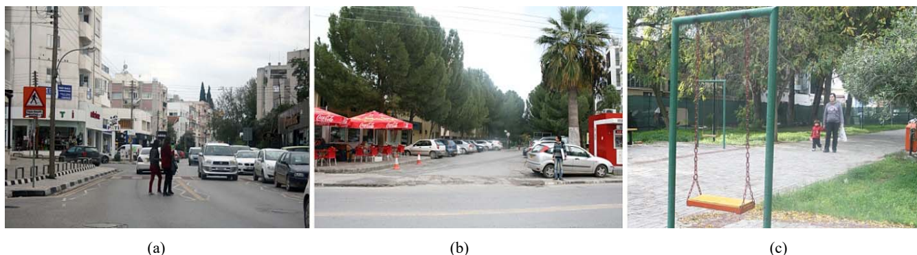
Fig. 3 (a) Pedestrian and cars in conflict (b) Entrance of park as a parking lot (c) Park as a pleasant pedestrian path, and lack of functions around it

fences, and the entrance of the park is occupied by cars. Also, use for orientation. (Figs. 3 (b), (c)) there is no significant landmark exists in the street in order to