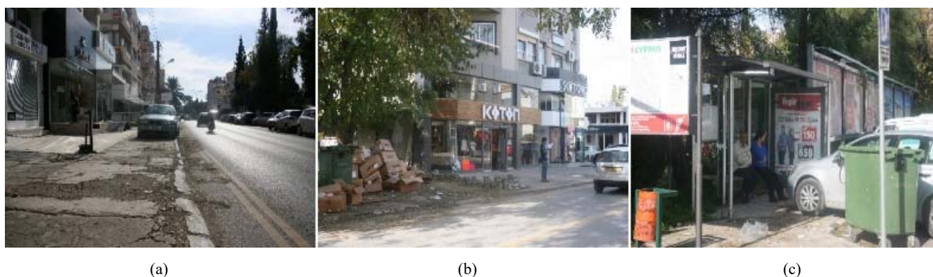
Fig. 4 (a) Pedestrian quality (b) cleanliness of the street (c) street furniture and bus stop location, cars blocked pedestrian path

The functions of street include; shops, restaurant, offices, residential, hotels and other facilities. Organization of functions is random through the street, and relationships between the residential parts and other functions are weak. The street is not serving the daily needs of the nearby residents; due to this fact, local people who can access the street by walk do not use the street efficiently. Despite this weakness, the street seems to be attractive for the public in terms of 'brand shops', 'restaurants', 'cafes', 'banks', and 'offices'. The facade of the street is covered by different types of buildings in different height levels between 1 and 6 stories. There is no unity among them in terms of facade, height, material, etc. (Fig. 3 (a))