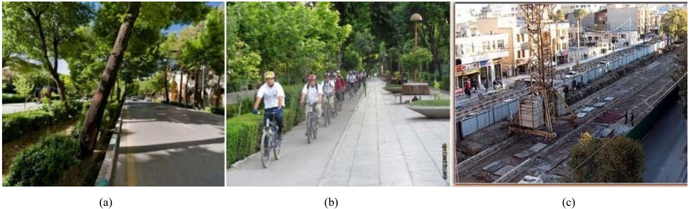
Fig. 7 (a) Vehicle path (b) Bike and pedestrian path (c) Subway construction, [30]

Chaharbagh Street has been known as a multifunctional street specially used as shopping and entertainment space. Multifunction of street has made this it live street in 24 hours of 7 days. Also existence of historical and monumental buildings in this street present the space as an identifiable street which is memorable for users even the once visiting. Façade of the street made by this building has unity along the street, even they were for a different historical period. The height level of the buildings is average between 1 to 3 stories