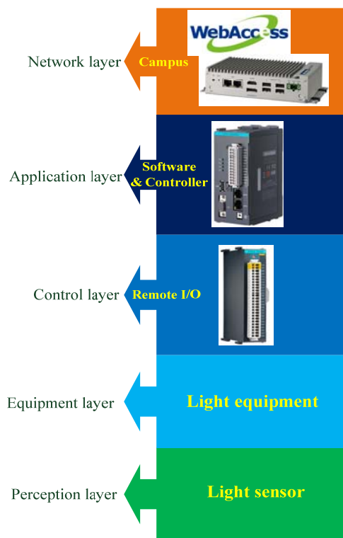
Fig. 1 The model of IoT

includes (1) perception layer, (2) equipment layer, (3) control layer, (4) application layer, and (5) network layer. Fig. 1 shows the model of the IoT.