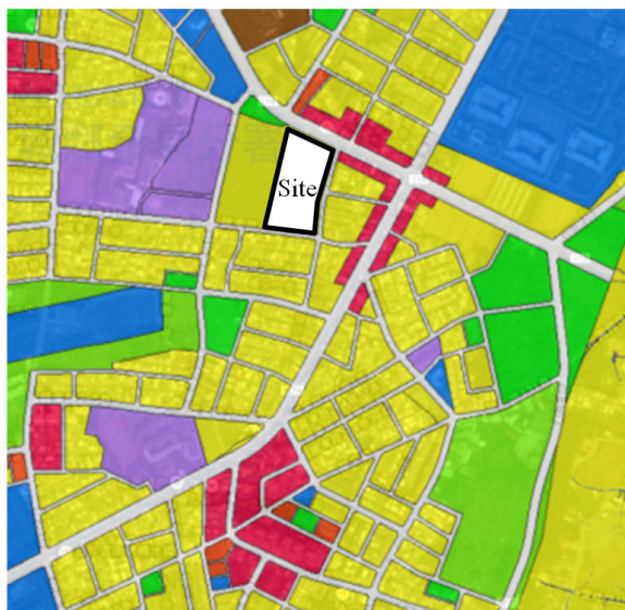
Fig. 2 The site location and zoning map around the site