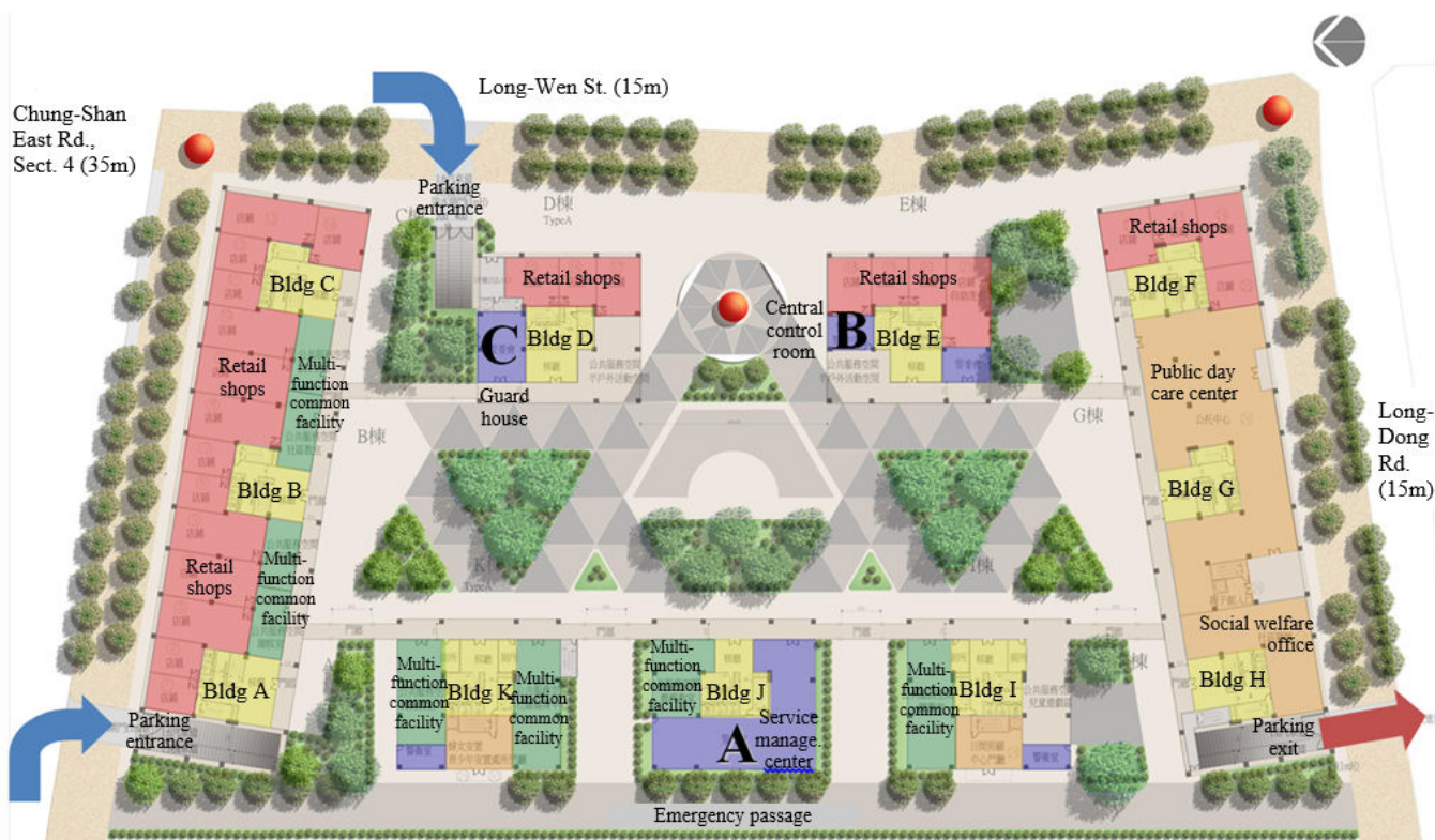
Fig. 4 The site plan and first floor plan of the Chung-Li Public Housing design scheme