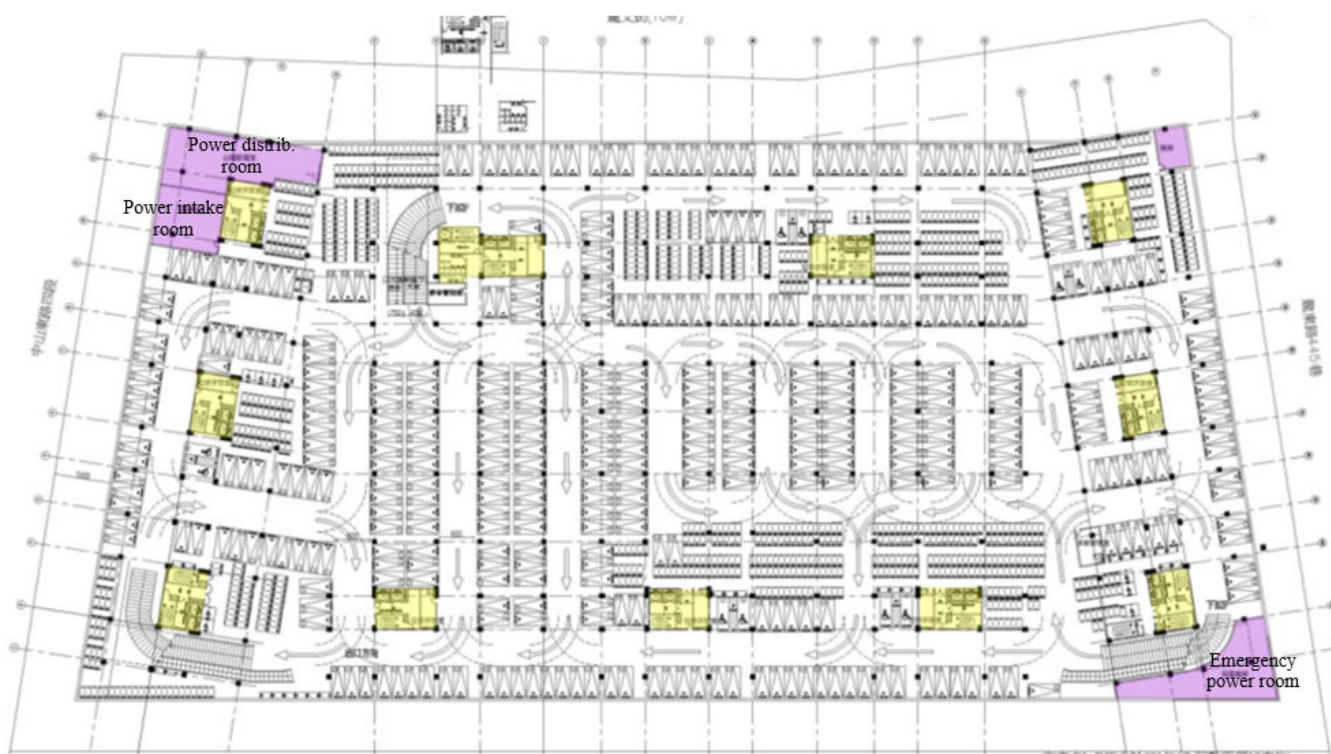
Fig. 5 The B1 floor plan of the Chung-Li Public Housing design scheme