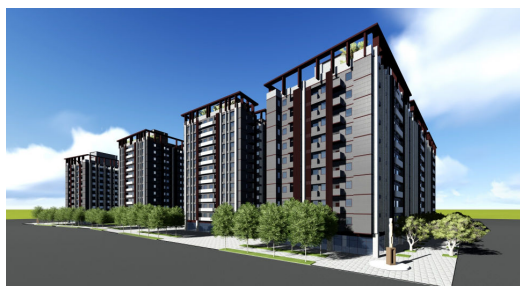
Fig. 6 The exterior view of the Chung-Li Public Housing design scheme (viewed from the north-east corner)