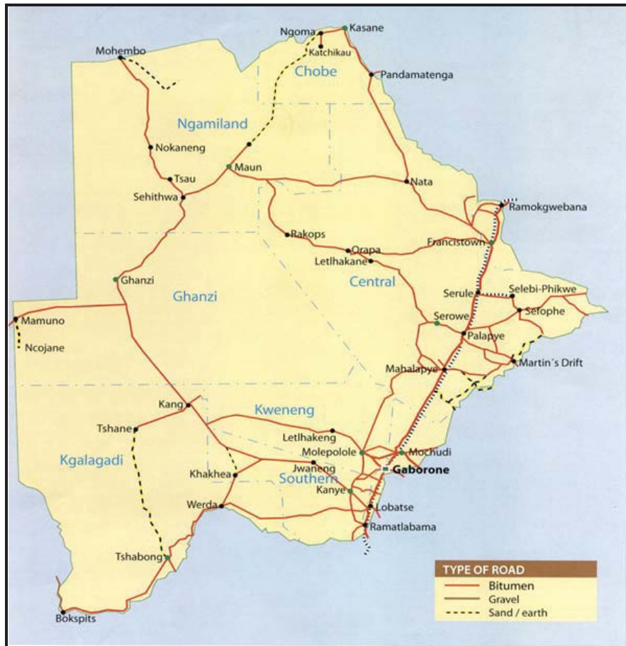
Fig. 3 Map of Botswana