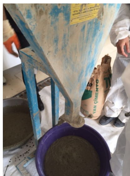
Fig. 4 V funnel test