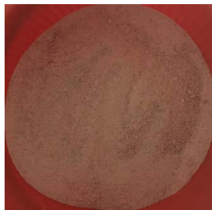
Fig. 2 Waste marble aggregate

Polycarboxylic ether based high range water reducing admixture (Glenium TC 1571) was used. All mixes had 1.5% of superplasticizer by weight of cement. The typical properties of Glenium TC 1571 obtained from BASF construction chemicals is shown in Table VI.