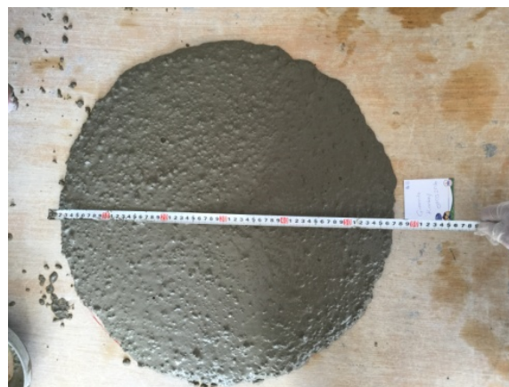
Fig. 3 Flow and T 50 time testing

According to EFNARC, there are two different T 50 time classifications for SCCs: VS1 and VS2. According to this report, VS1's T 50 time should be ≤ 2s and VS2's T 50 time >2s. According to T 50 time test results, T 50 time values of self compacting lightweight concretes were measured between 4 and 9 s. As seen in Table VIII, all mixes are in limit of VS2. According to the test results, use of waste marble was positive affect the workability of self compacting lightweight concrete.