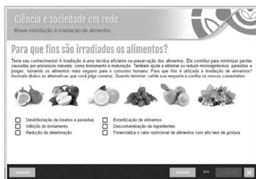
Fig. 3 Interactive exercises to check public's previous knowledge