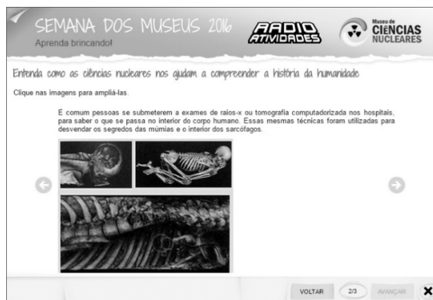
Fig. 4 X-rayed mummies at the British Museum

Moreover, the entire project is designed to guarantee a user-friendly and functional system with great performance on mobile devices, as seen in Fig. 5.