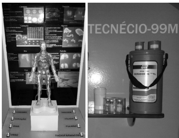
Fig. 2 Interactive panel and material used to explain nuclear medicine

Expanding its array of activities far beyond the geographic frontiers of the museum in order to build new bridges between nuclear science and society, the museum team promotes public exhibitions in shopping centers, as well as summer courses. The Summer Course is a programme of the Brazilian National Network of Education and Science to enhance science education throughout Brazil. In a one-week-course, participators experience new approaches to teach and learn science. In January 2015, 17 teachers attended the training course "Playing with the atom", offered by the Nuclear Science Museum [1].