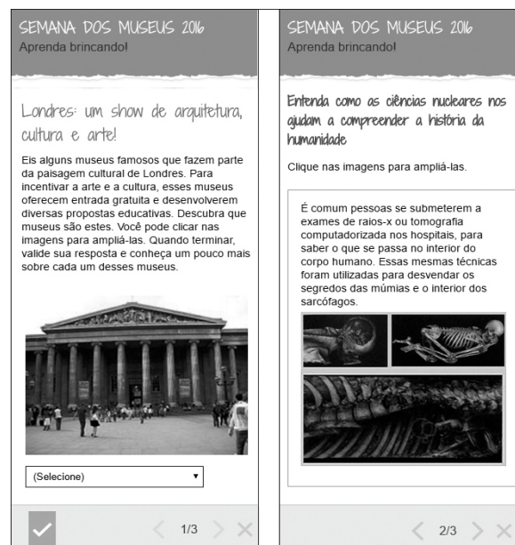
Fig. 5 Interactive activities for mobiles