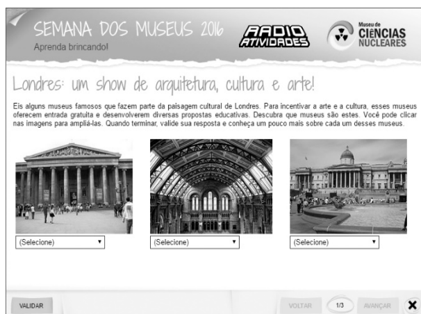
Fig. 3 Discovering some famous museums in London

The interactive activities were developed combining several technologies, such as PHP, MYSQL and HTML 5. PHP and MYSQL are two of the most popular Open Source scripting languages. HTML5 is essential to design and develop high quality animations that load quickly and look great.