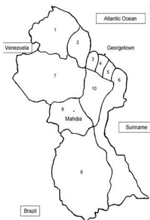
Fig. 1 Map of Guyana showing the rice growing Regions (Regions 2, 3, 4, 5, 6 and 9) [6]

There are four major aflatoxins, B 1 , B 2 , G 1 and G 2 with B 1 usually being the aflatoxin in highest concentration in contaminated feed and food including rice [7], [8]. Aflatoxin B 1 is also the most potent and is rated as a Group 1 carcinogen because there is evidence that it causes hepatocellular carcinoma in humans [9]. In 2004, 125 Kenyans died of acute