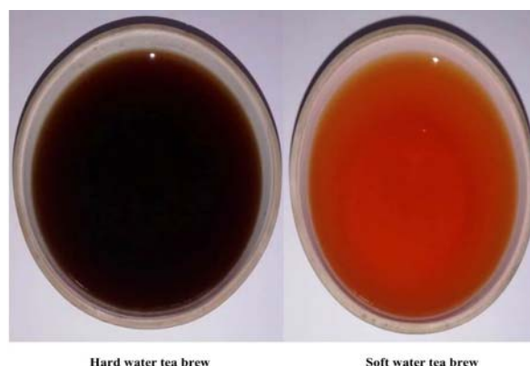
Fig. 1 Tea brewed Soft and Hard water

The free chlorine can be a source of carcinogenic diseases. 0.2 ppm is the permissible limit of free chlorine as per Indian standard [14]. Purification of water using calcium hypochlorite may increase the FRC. Above the permissible limit, FRC does not affect the brewing quality as FRC escapes from water when boiling. The quality of tea brew is not determined by the desired tea, but also by the water used for brewing. Bad quality water gives bad tea with inferior liquor which has undesirable qualities. Good quality water gives good tea with appeal and taste.