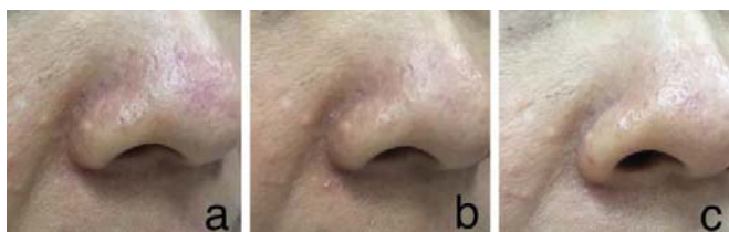
Fig. 5 Clinical appearance of the patient with seborrheic dermatitis at base line (a), days 14 (b), and 28 (c) after treatment with 2% C. aeruginosa Roxb. extract-containing cream