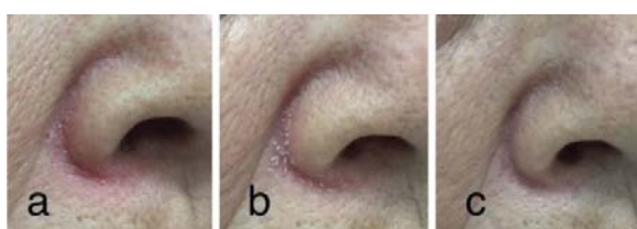
Fig. 2 Clinical appearance of the patient with seborrheic dermatitis at base line (a), days 14 (b), and 28 (c) after treatment with 2% C. aeruginosa Roxb. extract-containing cream