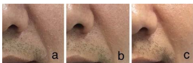
Fig. 4 Clinical appearance of the patient with seborrheic dermatitis at base line (a), days 14 (b), and 28 (c) after treatment with 2% C. aeruginosa Roxb. extract-containing cream