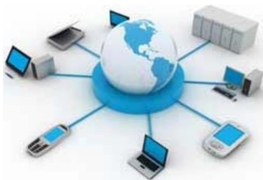
Fig. 2 Service users using diverse computing tools [5]