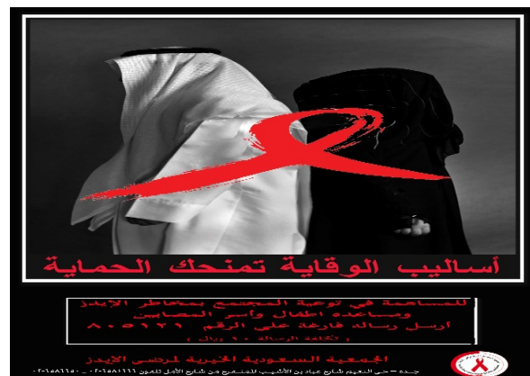
Fig. 6 Arabic-English Translation for HIV/AIDS brochure from Saudi Charity Association for AIDS Patients distributed in 2014

Protection from HIV infection is in your hands as shown in Fig. 6.