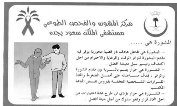
Fig. 7 Arabic-English Translation for HIV/AIDS brochure from KSA Ministry of Health containing basic information about HIV/AIDS distributed in 2008

From Fig. 7, Center for Voluntary Counseling and Testing Counseling is: