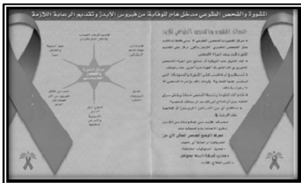
Fig. 2 Arabic HIV/AIDS brochure from King Saud Hospital containing information about counseling - distributed in 2008

Arabic-English Translation for HIV/AIDS brochure from King Saud Hospital containing information about counseling - distributed in 2008.