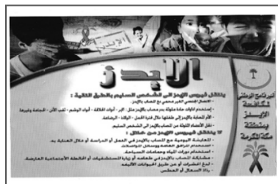
Fig. 4 Arabic HIV/AIDS brochure from KSA Ministry of Health containing basic information about HIV/AIDS distributed in 2008

Arabic-English Translation for HIV/AIDS brochure from KSA Ministry of Health containing basic information about HIV/AIDS distributed in 2008.