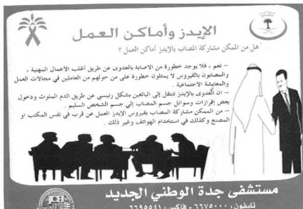
Fig. 8 Brochure from New Jeddah Clinic Hospital about AIDS in the Workplace