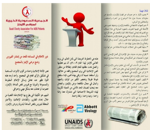
Fig. 12 Arabic for HIV/AIDS brochure from Saudi Charity Association for Media Producer -distributed in 2014