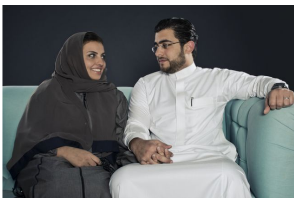
Fig. 1 Example of Support

How can you support your loved one with HIV/AIDS?