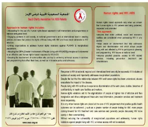
Fig. 11 (b) English HIV/AIDS brochure from Saudi Charity Association for Health Care Providers distributed in 2014