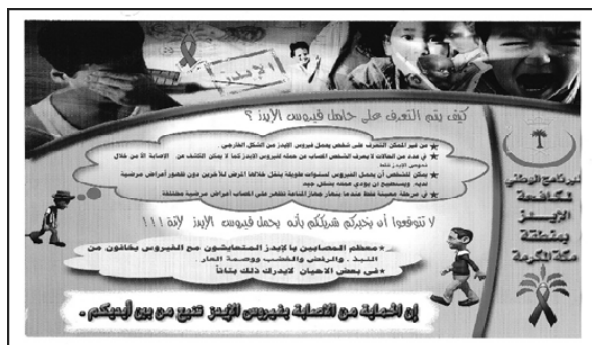
Fig. 5 Arabic HIV/AIDS brochure from KSA Ministry of Health containing basic information about HIV/AIDS distributed in 2008

Protection from HIV infection is in your hands as shown in Fig. 6.