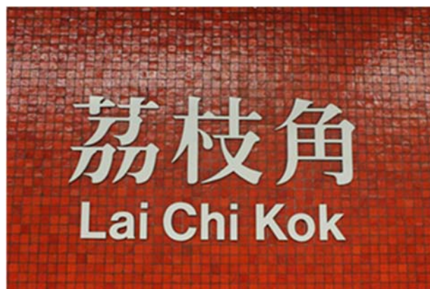
Fig. 1 One of the signs in the Hong Kong Mass Transit Railway [21]