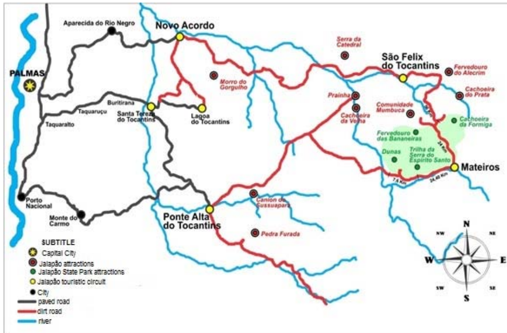
Fig. 5 Localization map of the Parque Estadual do Jalapão [7]

that support the community when developing the activities at the site.