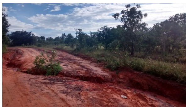
Fig. 8 Access road to the city of Mateiros

As for the water supply, respondents reported that there is a constant lack of available water in Mateiros; a problem is exacerbated during the tourism season, when the demand for water by stakeholders in the tourism sector increases.