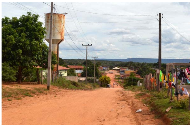
Fig. 7 Streets of Mateiros

referred to the water supply, public cleaning services, public security, banking services and tourism signage.