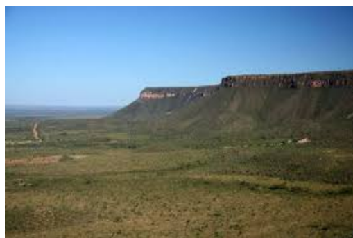
Fig. 2 Serra do Espirito Santo