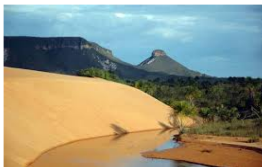
Fig. 1 The Dunes

Among the towns that make up the Jalapão, Mateiros (9,681,657 km 2 ; 2,223 inhabitants) is one that profits most from the tourism flow in the region [3]. It is in a privileged location in relation to the others. It is also the town that is nearest to the park attractions; thus, it is the main center for receiving tourists and where tourists tend to stay longer during the seasons.