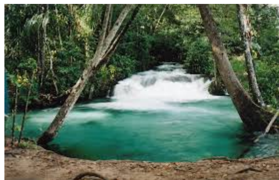
Fig. 4 Formiga Waterfall

The site has natural tourist attractions that propitiate the practice of ecotourism: dunes, waterfalls, mountains and ecological trails (see Figs. 1-4). The attractions have been exploited in a disorganized manner, as the efforts towards touristic planning have shown to be ineffective.