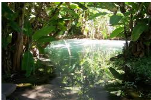
Fig. 3 Fervedouro das Bananeiras