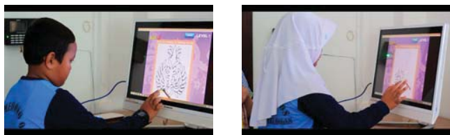
Fig. 3 Children interacted with BatiKids through touch screen