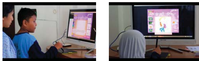
Fig. 1 Children used graphic tablet with pen to interact with BatiKids

The result of 12 children interacting with the application through the graphic tablet with pen is shown in Fig. 2. The task of creating or drawing the pattern was the most difficult part for children in this group. Half of the children in this group had to spend more time to complete this task. Hand movements with pen on the tablet required patience and concentration from children.