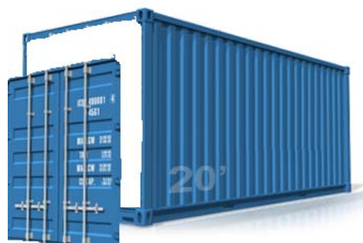
Fig. 8 Smuggling has happened in spite of the container doors were not opened with the existence of an electronic seal