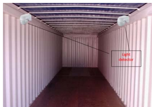
Fig. 7 Light detectors working wireless in parallel with an electronic tracking system should be fixed in internal the container

sends to the Jordan's regional and international control room (double-check security monitoring of an electronic transit tracking system), see Fig. 7. In some cases, smuggling was happened during the movement of transit truck from Aqaba seaport to Amman customhouse; the doors of the container were removed from its normal fixed points by cutting from the edges and still the doors were not open with existence of an electronic seal, despite that, the tracking system did not send any alarm to the main control room, see Fig. 8.