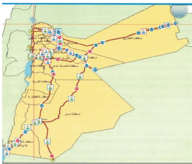
Fig. 3 Online monitoring of transit trucks [13]

Electronic tracking system for TT allows customs authorities' ability to monitor thousands of transit shipping trucks simultaneously on a real-time basis from a main central room that is equipped with many wall monitors as illustrated in Fig. 3. This system can prepare a report on a real-time basis in case any illegal events or actions occurred by the drivers. Also, this system can monitor the position and status of the transit trucks during moving on the predetermined fixed routes on real-time basis and based on predetermined time intervals or distances. All transit trucks will be allowed to travel separately with no needs for physical escorts on predetermined routes, electronic geo fences are established around these fixed routes and the areas that have a probability to be used for