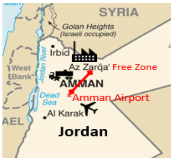
Fig. 1 (c) Transit at exportation, from AL-Zarqa free zone to Amman international airport