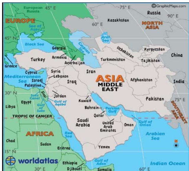
Fig. 2 The strategic location of Jordan (Middle East map) [19]

implemented since 2008 till present but covering just locally monitoring.