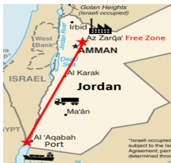
Fig. 1 (b) Transit at importation, from Aqapa seaport to inland Customs office