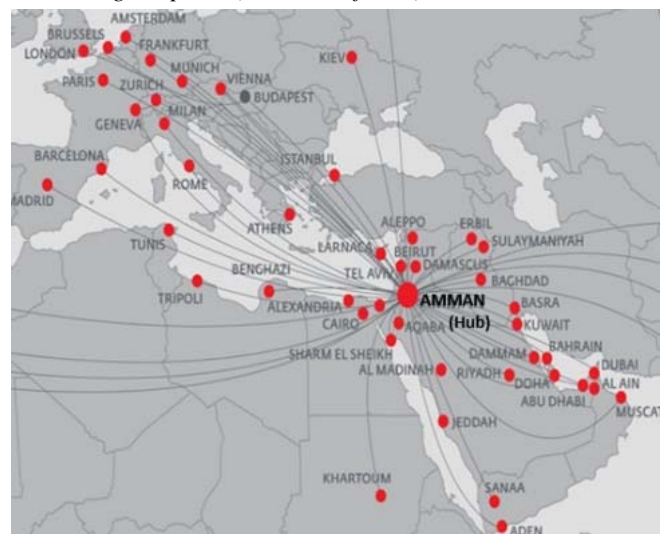
Fig. 6 Middle East Map (Jordan as a regional and international office for electronic TT monitoring) [19]

Due to the strategic location of Jordan in the Middle East, Jordan can be used as a regional and international office (hub) for monitoring TT; this can be done through preparing, establishing and expanding its infrastructure, initiating legal framework, coordinating and cooperating with other institutions, using and applying harmonized procedures, offering advanced reliable and dependable communication tools, using high advanced technology and other elements governing the movements of transit goods and traffic,