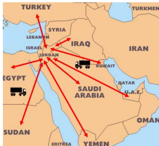
Fig. 1 (a) Regional and/or international TT from Jordan to different countries in two ways

the core principles related to transit in traffic that any transit country shall follow as non-discrimination and freedom of the transit. One of these international conventions is Revised Kyoto Convention (RKC) that adopted by the World Customs Organization (WCO) and provides technical details on how to apply and implement transit procedures, supplemented by a large portfolio of supporting tools including RKC Guidelines and Customs Transit Compendium [27]. [11] has taken into account some legal instruments and summarized general provisions that applicable to Customs transit as shown in Table I.