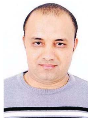
Fig. 2 Cover Image

In the conversion process of image to matrix, we convert the input cover image into matrix values which is stored in a text file. Firstly an image is read from computer, the original image is in the form of RGB which is converted into grey image. The grey image is resized to a particular size of 256*256. Each image has intensity values for every pixel, here these intensity values are stored into a text file. The secret image is shown in Fig. 3.