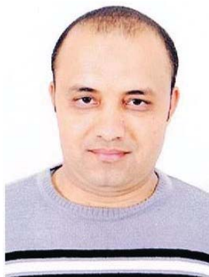
Fig. 4 Stegano Image

(secret image) from cover image and transmit to PC. We need new powerful Steganalysis techniques that can detect messages without prior knowledge of the hiding algorithm (blind detection). The detection of very small messages is also a significant problem. Finally, we need adaptive techniques that do not involve complex training stages. The comparison between the LSB method and the proposed method using experimental results demonstrate that our original and optimal proposed method keeps distortion low and uses a low memory capacity and a less execution time due to the reduced number of needed bytes, 5 against 8 in conventional LSB technique.