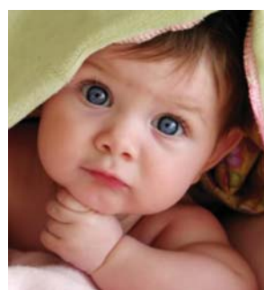
Fig. 3 Secret Image