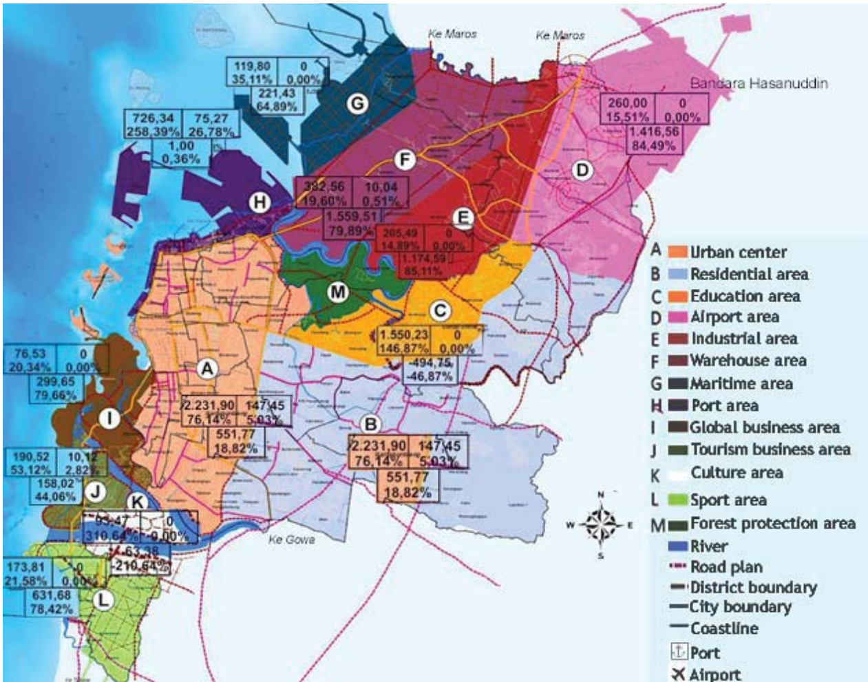
Fig. 2 Official land use maps of Makassar city government [19]