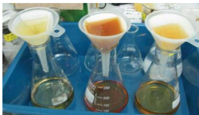
Fig. 1 WCO filtration using filter paper

The oil undergoes degradation due to heating and it also forms polymer and other types of impurities due to its reaction with water. By filtration, solid particles and the seen impurities were removed from waste cooking oil and the moisture content. Acidity and the fatty acid profile of the waste cooking oil were tested. Filtered oil was kept in sealed bottle to avoid reaction with air, prior to use. The appearance of the cooking oil was dark yellow with a specific gravity of 0.926, acid value of 0.16 mg KOH, viscosity 17 cSt and moisture content of 0.9-1.8%. Many studies reported about the modification of cooking oil [11]-[13]. Through their studies, they concluded about the properties of vegetables oil such as good lubrication properties, viscosity index, flash point and pour point. Blending of oil with other waste materials reported to have better quality [14], [15].