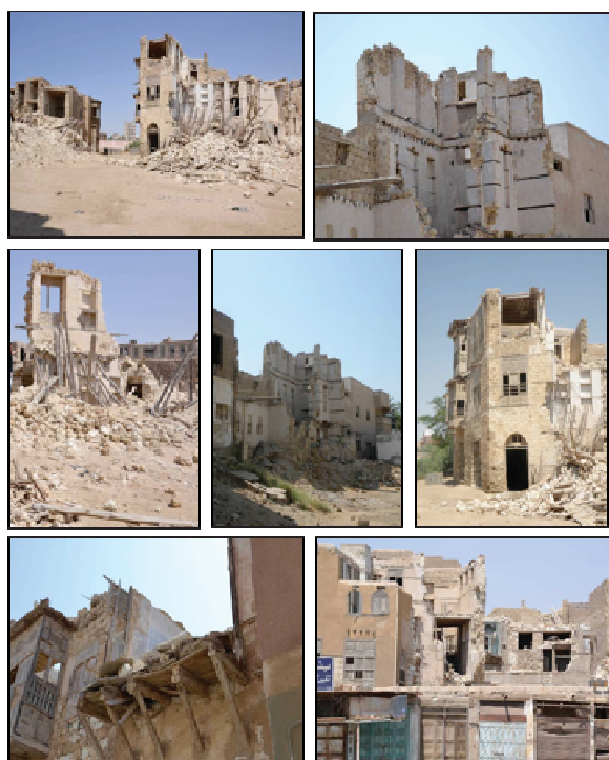
Fig. 2 Photographs showing the current physical conditions of Old Yanbu

The settlement spanned from the bay area towards the north. To sustain itself, civilians capitalized on the natural resources like coral from the reef, fishing from the sea, potable water from occasional oases formed of the rains near the Radwah Mountains, and pastoral and arable lands for cultivation and farming. It derived its economy from commerce, socio-politico structure from religion and the sense