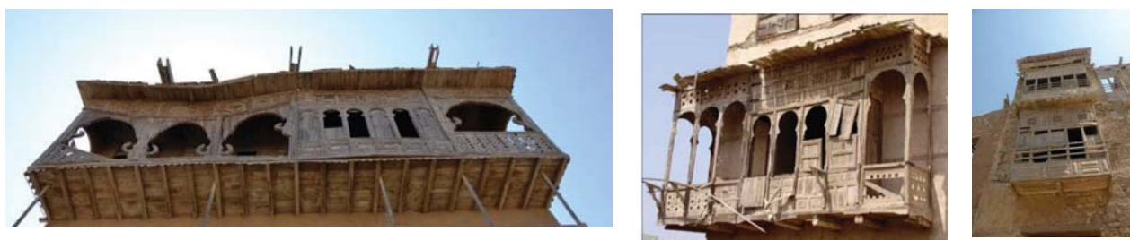
Fig. 5 Examples of Yanbu's Rowshans

Under the politics of tribal culture, a defensive wall with turrets was erected covering the extent of the residential districts as a whole. It accorded esteem along with security to the inhabitants (Burton notes people boasting of its strength). Moreover, it also distinguished the settlement as 'urban' for its regulated developments while fencing it from the assaults of nomadic tribes that comported different lifestyle. Eight residential districts are recognized to have existed, namely Khareek, Al Saida, Al-Quad, Al-Assor, al- Mangara, Abbas, Refaa, and al-Rabghi. Of all, only the Al-Asoor district could be realized before complete diminution.