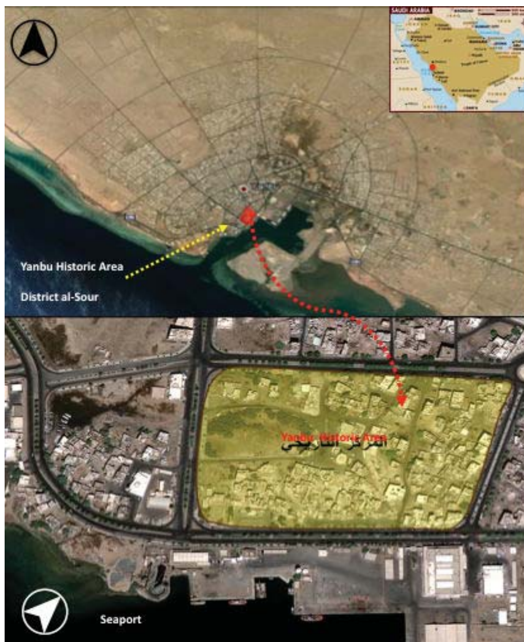
Fig. 1 The location of historic area relative to Yanbu Industrial City [1]

Open Science Index, Architectural and Environmental Engineering Vol:10, No:10, 2016 publications.waset.org/10005506/pdf