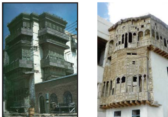
Fig. 3 Examples of Yanbu's traditional buildings [8]

of security from the natural defensive surroundings. The scarce remains of old Yanbu include some buildings in Haret Asoor, and the Souq Al-Lail (Al-Lail Market) [9] (Fig. 4).