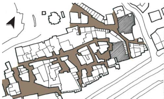
Fig. 6 Layout of the outdoor spaces of old Yanbu

It has been a conscious decision to use the word 'settlement' instead of 'city' while referring to the traditionally built-environment of Saudi Arabia. It is but pedantic, explaining the sense of how and when settlements began to be called 'cities'- planning jargon. 'City' associates with itself a service hierarchy or degree of interaction with higher and lower order cities as classified under the order of the cities in planning system. Whereas pre-modern Arabian settlements were resolutely isolated and self-sustaining organisms that did not quite orientate itself within a such planning hierarchy. Furthermore, even current cities have not yet aligned in absolute terms with this order, though they are all planned with that sense. However, right this might be, it leaves scope for another research.