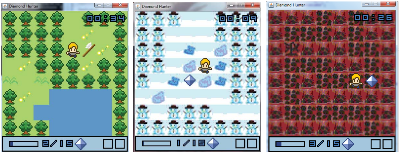
Fig. 1 Diamond Hunter Themes