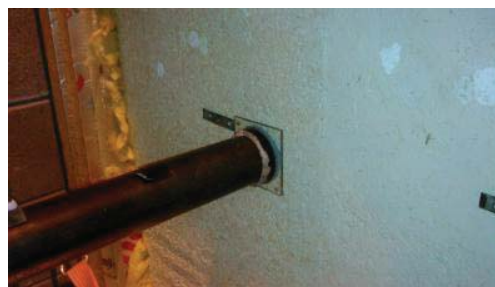
Fig. 2 Impedance tube contacting section of hemp-GGBS wall