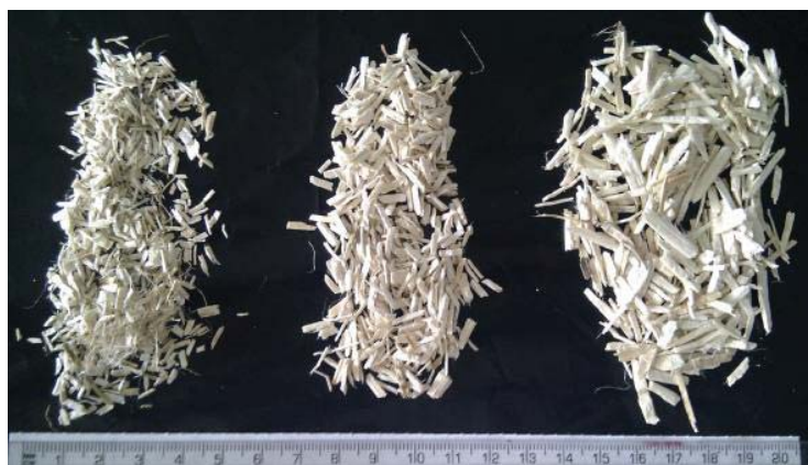
Fig. 1 Hemp particles of varied scale

Acoustic absorption was tested on hemp lime wall sections in a laboratory with minimal background noise. Details of the materials and testing procedure are outlined below.