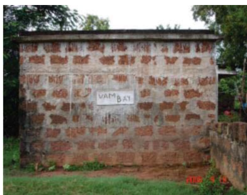
Fig. 1 A VAMBAY prototype at Sampur Chhaka [12]

A central government sponsored program called VAMBAY, provides the funds for construction and slum-upgradation for EWS and LIG [11]. Fig. 1 shows a typical prototype house made by VAMBAY for a shelter to EWS.