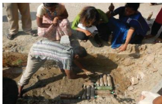
Fig. 2 Laying of plastic bottle [15]

are replaced with plastic bottle waste construction, the affordability rate by EWS and LIG will improve due to low-cost benefit.