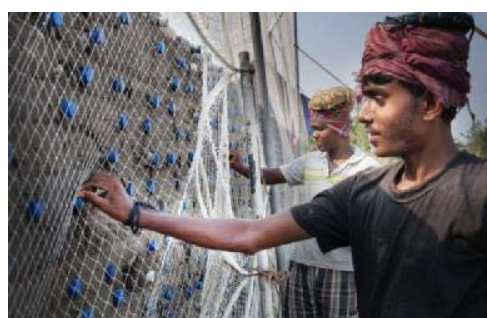
Fig. 3 Using Nylon fishing net [15]