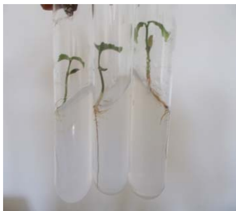
Fig. 7 21 day-old plantlets of Treculia africana in half strength MS medium