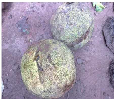
Fig. 2 Fruits of Trecculia africana Decne (0.2)