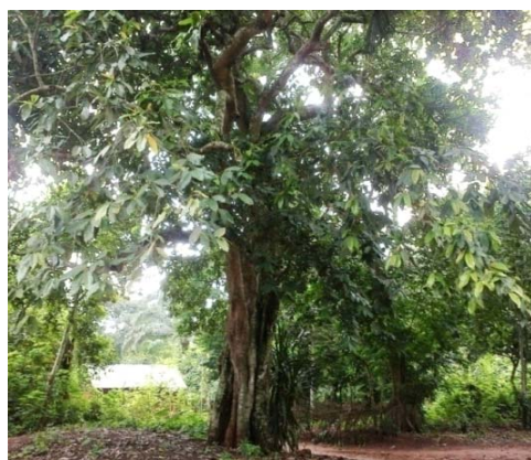
Fig. 3 Trecculia africana Decne tree (0.002)