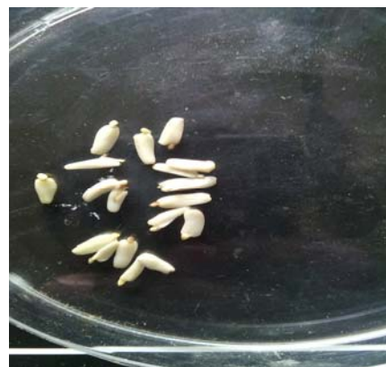
Fig. 5 Embryos of Trecculia africana Decne (0.2)