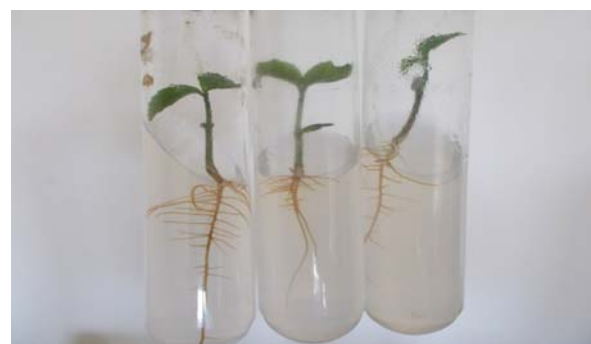
Fig. 6 21 day-old plantlets of Trecculia africana in full strength MS medium