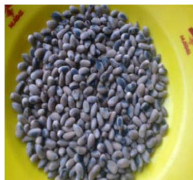
Fig. 4 Seeds of Trecculia africana Decne (0.2)