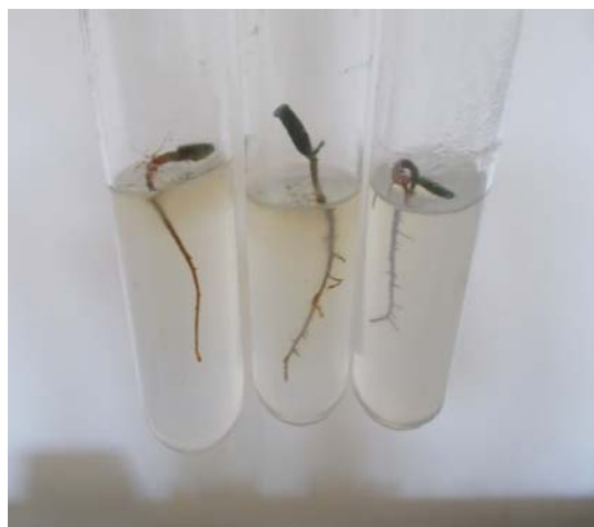
Fig. 9 21 day-old plantlets of Treculia africana in control treatment