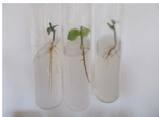
Fig. 8 21 day-old plantlets of Treculia africana in quarter strength MS medium