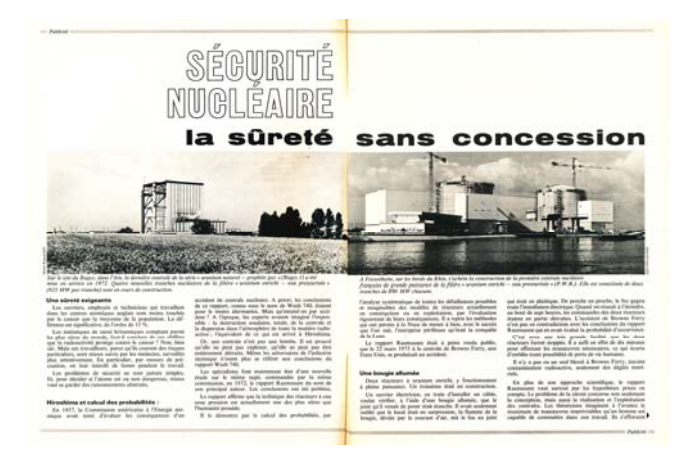
Fig. 6 Advertisement about nuclear safety and security [13]

the majority of the articles, thus in the minds, especially for the young. Doubts and questionings were distilled again about the security question as the Seveso accident on July, 1976, increased the assimilation of the chemical and nuclear industries. Moreover, this security question was gradually reinforced as, whatever the progress of technology, uncertainties appeared on the role of men in nuclear accidents. The result was a renewed attention given to environmentalists, especially as the 1978 parliamentary elections seemed to lead to a victory of left-wing parties in France.