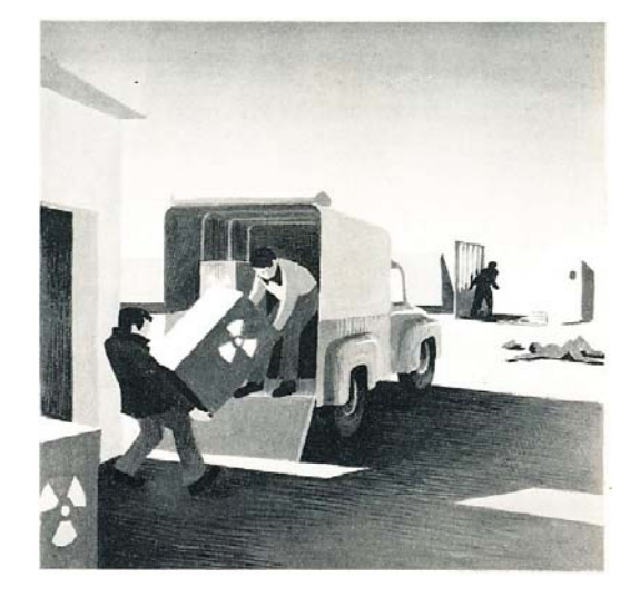
Fig. 4 Imaginary scenario of three terrorists stealing plutonium in a nuclear power plant, after having knocked out the only night watchman [11]

The anxiety generated thus by many articles was at the end of 1974 translated by a press campaign led by L'Express against nuclear energy, as the owner of this news magazine, Jean-Jacques Servan-Schreiber, tried to use this theme to recover some of the political influence he had lost after being evicted from the new French government for his strong opposition to the next French nuclear tests. Quickly, the other news magazines, as the all French press, followed the movement. In addition to the previous arguments and mental images already used, the limits to the growth were put into question as grew the will to consider other energy sources and to reduce the energy consumption in general, thus to stop the development of new nuclear power plants. Indeed, the nuclear risk could now lead to death, as the danger of the poisoning and carcinogenic plutonium linked to the future breeder reactors was more put forward, as well as the potential threat of terrorism, especially as was asserted that the current nuclear power plants were less well watched than banks (Fig. 4) or that it did not seem to be more difficult to hijack a truck transporting nuclear waste than a plane. Thus, the nuclear risk was presented as now leading to panic in France, at last to a sudden awareness, with for result the necessity to consult from now the local population before any new implementation.