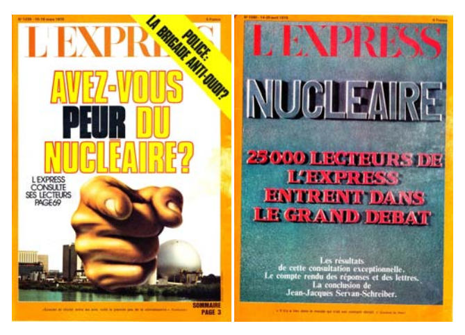
Fig. 5 Opinion poll launched by L'Express and results [12]

As the media debate increased steadily, it led to a political debate. Members of the French government replied, as well as the great leaders of the nuclear sector, redressing the balance. On the other hand, the large surveys and opinion polls launched for the occasion (Fig. 5) did not give exactly the expected results: certainly fears expressed about safety, wastes, environmental damages, but the people polled - with an exception for the young – approved then the nuclear power program as a national priority, were not ready to restrict their standard of living to avoid the risks put by this technology, and even agreed to live near a nuclear power plant. Moreover, they were still confident in the official spokesmen, although they regretted a lack of information. Certainly, the debate had gone too far to stop there: a parliamentary debate was organized in May 1975. But, here again, its conclusions did not give the expected results: in view of the extent of the energy crisis, no speaker of any political party rejected then the civilian use of nuclear power. Certainly, there was unanimity on the necessity to control the development of nuclear power plants, and that this control had to be independent from the government. At last, if some opinions diverged on the questions of risks and lack of information, that was all: what gathered the political parties was then much more important than what separated them.