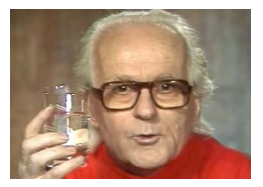
Fig. 3 René Dumont, a 1974 French presidential candidate taking into account environmental concern [10]

The anxiety generated thus by many articles was at the end of 1974 translated by a press campaign led by L'Express against nuclear energy, as the owner of this news magazine, Jean-Jacques Servan-Schreiber, tried to use this theme to recover some of the political influence he had lost after being evicted from the new French government for his strong opposition to the next French nuclear tests. Quickly, the other news magazines, as the all French press, followed the movement. In addition to the previous arguments and mental images already used, the limits to the growth were put into question as grew the will to consider other energy sources and to reduce the energy consumption in general, thus to stop the development of new nuclear power plants. Indeed, the nuclear risk could now lead to death, as the danger of the poisoning and carcinogenic plutonium linked to the future breeder reactors was more put forward, as well as the potential threat of terrorism, especially as was asserted that the current nuclear power plants were less well watched than banks (Fig. 4) or that it did not seem to be more difficult to hijack a truck transporting nuclear waste than a plane. Thus, the nuclear risk was presented as now leading to panic in France, at last to a sudden awareness, with for result the necessity to consult from now the local population before any new implementation.