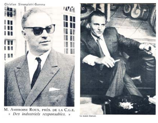
Fig. 2 "Responsible industrialists" [9]

appeared. Gradually, the theme of pollution expanded, at the same time France definitely gave up its technology of gascooled graphite moderated reactors. The first pressurized water reactor that had to equip the Fessenheim nuclear power plant led to controversies: in addition to the dissatisfaction of the riparian countries was said that the water of the river would be warmed by some degrees, with numerous consequences for the ecological balance. Behind this theme, the real concern appeared: nuclear power plants were not yet such a bad thing, providing that they were built "not in my backyard". As if a new argument was then to be found, the notion of risks surrounding this technology began to be brought up: that of the waste storage, that of the potential diversions of fissile materials, that of the accidents which could affect nuclear power plants.