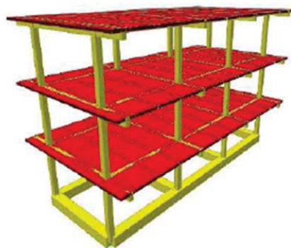
Fig. 1 Structural model used for analysis

The structural model, corresponding to a reinforced concrete structure is described in [14]. The time history analyses have been performed using SAP2000 software [15]. The results of the time history analyses for the types of loadings are listed in Table I in terms of maximum relative displacements.