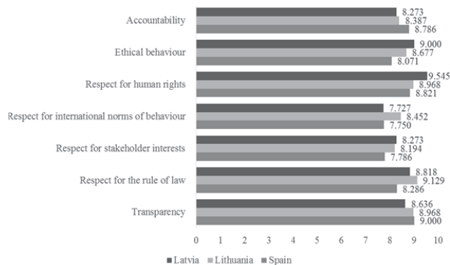
Fig. 2 Social Responsibility principles importance for respondents considering on a future employer by country

For the respondents from each observed country are important different principles of Social Responsibility. On average, all respondents evaluated importance of all SR principles high i.e. from 7.720 to 9.545 points (Fig. 2).