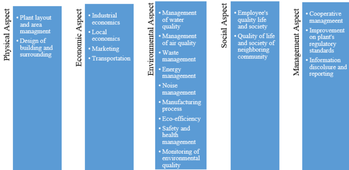
Fig. 2 The concept of Eco-industrial development: 5 dimensions 20 factors