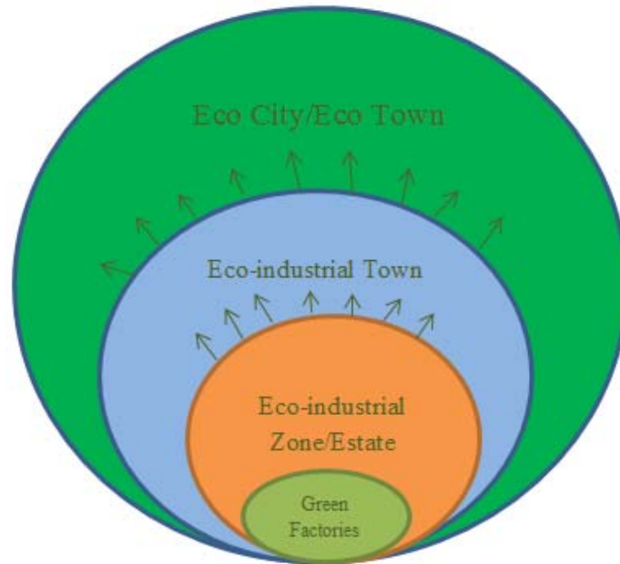
Fig. 1 The relationship between Eco-Town and Eco-Industrial Town

The concept of Eco-Industrial development has been applied to nine industrial parks in Thailand since 2009. The Eco-Industrial development reports show the uses of five development dimensions including 20 factors. The five development dimensions are physical, economic, environmental, social, and management dimensions. Detailed factors are shown in Fig. 2.