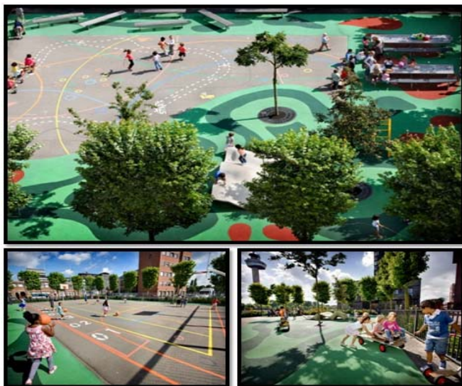
Fig. 4 Mullerpier Public playground in Rotterdam, Netherlands

unique and inviting square currently also meets the needs of the children within the surrounding urban environment by serving as a public playground [12]. Adding to the “green” element of the area, the space is surrounded by trees, improving sustainability. With sufficient activities, different surfaces as well as the incorporation of the green element provided in the space, as identified in Fig. 4, opportunities are provided for children to interact on different levels.