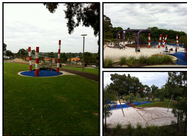
Fig. 3 Kadidjiny Park in Melville, Australia

The Kadidjiny Park is fenced, which ultimately improving the safety element for the main user group of the space, mainly the children. In addition, the park is almost four hectares in size, contributing to the fact that it caters for all user and age groups in order to enjoy the outdoor space in Melville, along with sufficient benches provided in the space [12]. The space promotes the idea of children to be creative within their natural environment, where the name Kadidjiny comes from the Aboriginal Noongar word meaning “learning, thinking and listening” [7].