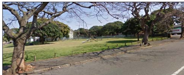
Fig. 5 Current use of identified space

Currently the space is being used as a “play area” for children. Elements such as slides and swings can be identified within the space, but the space is neglected, with an uninviting and unsafe feeling as the space is located adjacent to 3 roads.