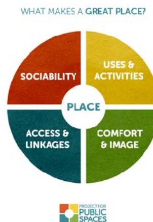
Fig. 2 The Place Diagram [28]

In order to provide spaces and place with meaning, the process of place-making has a certain criteria that should be followed to ensure a well-developed and designed space or place. Place-making can thus be described, defined and identified as flexible, inclusive, adaptable, ever changing, community-driven, inspiring as well as sociable and transformative. Fig. 2 illustrates the place diagram, developed by [28].