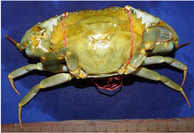
Fig. 13 Scylla serrata