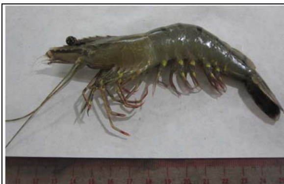
Fig. 7 Penaeus monodon