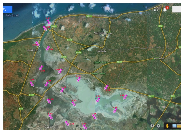
Fig. 1 Location of the Thondamanaru lagoon

Thondamanaru lagoon was selected for this study (Fig. 1). Similar to most other lagoons and estuaries in Sri Lanka, Thondamanaru lagoon also supports profitable shellfish and finfish fisheries. Thondamanaru lagoon lies approximately between 80°08'E– 80° 29' E longitudes and 9° 34' N – 9° 49' N latitudes [3], [7]. Thondamanaru lagoon is shallow tidal lagoon and its northwestern end is connected with Indian Ocean by narrow channel that is temporarily covered by sand bar [1].