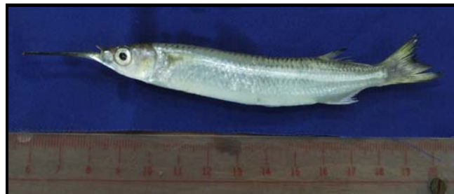
Fig. 4 Hemirhamphus sp