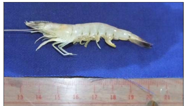
Fig. 9 Penaeus latisulcatus