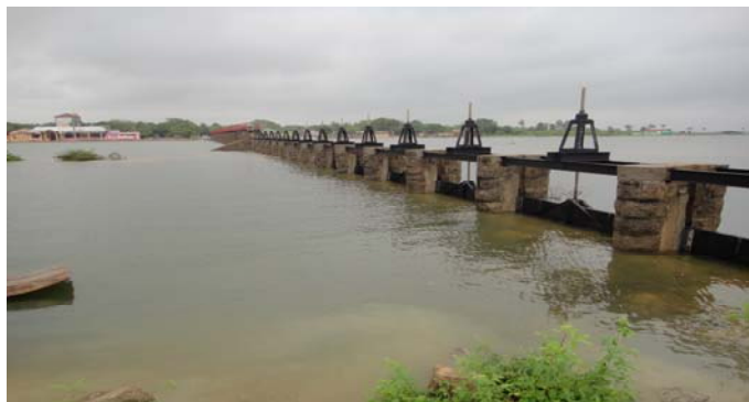
Fig. 2 Existing structures of the Thondamanaru lagoon

Randomly collected samples were placed in polythene bags. All collected specimens were brought to the laboratory in an ice box and analyzed.