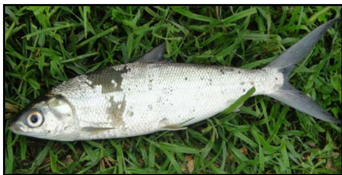
Fig. 3 Chanos chanos