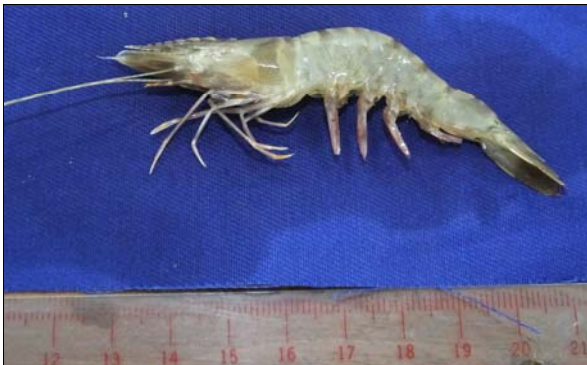
Fig. 10 Penaeus semisulcatus