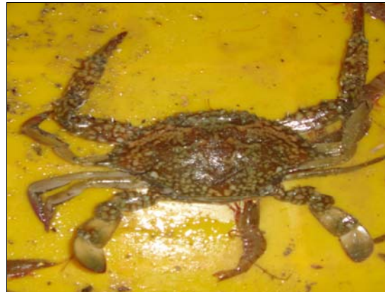
Fig. 12 Portunus pelagicus