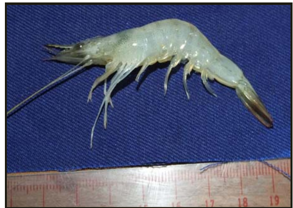
Fig. 8 Penaeus indicus