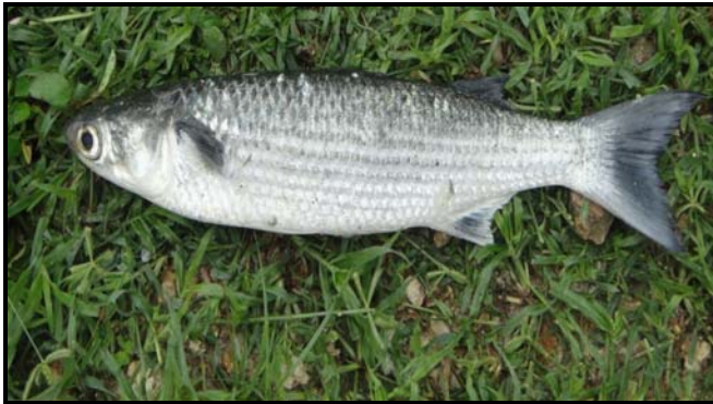
Fig. 6 Mugil cephalus