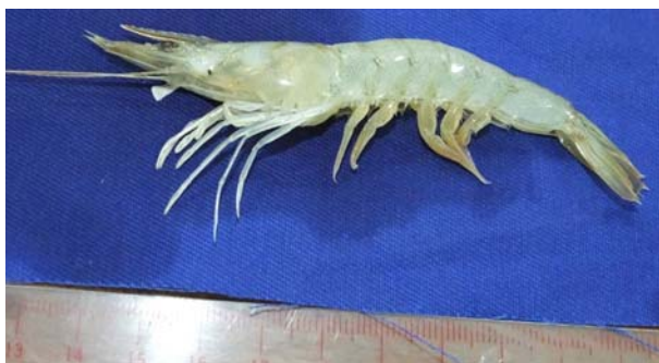
Fig. 11 Metapenaeus monoceros