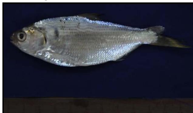
Fig. 5 Nematalosa sp.