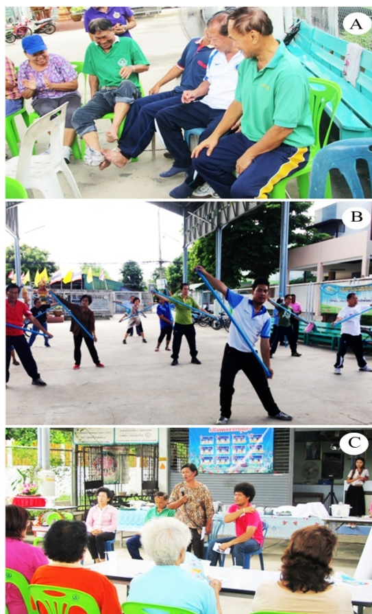
Fig. 2 The activity tasks for achieving elderly health care development; A. Social engagement B. Physical activity C. Cognitive stimulation