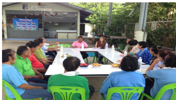
Fig. 1 Focus group meeting and interviews sharing in Paisanee Ramintra 65 Bang Khen region, Bangkok, Thailand

Assessment questionnaires, self-reported measures, in depth interviews and focus groups meetings and interviews (Fig. 1) are important techniques for CBPR. The results often offer valuable insights on the health of an understudied population. In addition, all techniques are well suited to explore health problems in a community which is poorly known in Paisanee Ramintra 65 aging population.