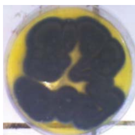
Fig. 1 Metarhizium anisopliae var acridium in growth media