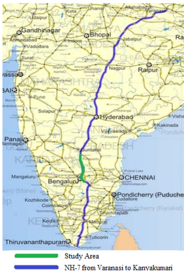
Fig. 2 Map showing the study area

over the year is accepted. Thus, it indicates that major accidents have a uniform distribution over a year.