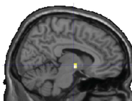
Fig. 4 Hypothalamus activity for mental task

In terms of cortical activity, the brain-stem and hypothalamus regions appear to be more active during the