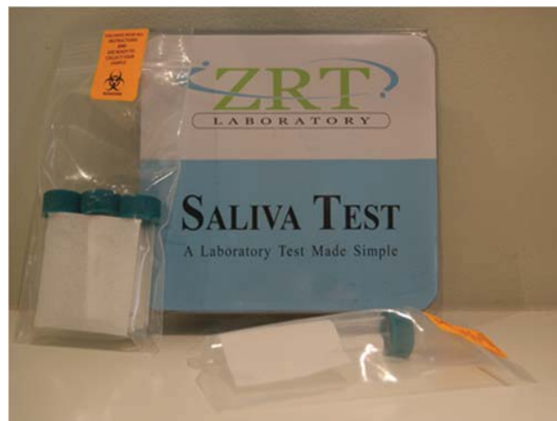
Fig. 1 Kit to test for cortisol in saliva

Saliva samples were collected at start and again after yawning response [Fig. 1], together with electromyography data of the jaw muscles to determine rest and yawning phases of neural activity [Fig. 2].