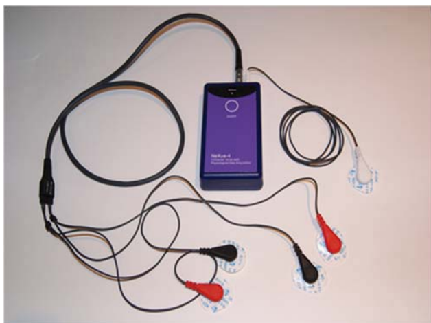
Fig. 2 Surface-placed electrodes to portable electromyograph

Exclusion criteria were: chronic fatigue, diabetes, fibromyalgia, heart condition, high blood pressure, hormone replacement therapy, multiples sclerosis, and stroke. Between- and within-subjects comparisons were made using t-tests and correlations using the SPSS package. This enabled a comparison to be made between yawner and non-yawner participants as well as between rest status and yawning episodes.