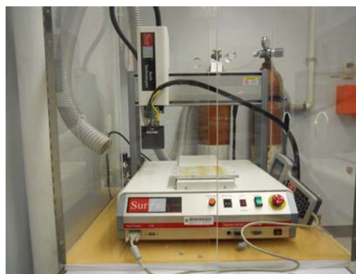
Fig. 1 Diagram of atmospheric pressure plasma system [4]

Plasma pre-treatment of cotton fabric was conducted by an atmospheric pressure plasma jet (APPJ), which can produce a stable discharge at atmospheric pressure with a radio frequency of 13.56 MHz. The plasma pre-treatment parameters of the cotton fabric were: (i) discharge power = 100 W and 130 W, 150 W; (ii) substrate speed = 10 mm/s; helium flow rate = 30 L/min.; oxygen flow rate = 0.3 L/min. and jet-to-substrate distance = 3 mm. Helium and oxygen were used as carrier and reactive gases, respectively. Figs. 1 and 2 show the diagram of the atmospheric pressure plasma system and the schematic diagram of atmospheric pressure plasma system used in this process, respectively.