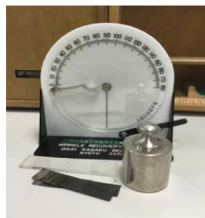
Fig. 3 Wrinkle recovery angle tester

Wrinkle-resistance was evaluated by wrinkle recovery angle (WRA) which was tested according to the AATCC Test Method 66-2003 (Option 2) (Wrinkle Recovery of Woven Fabrics: Recovery Angle). In this test, the face and back of the fabric sample should be identified first and the sample should be free from creases wrinkles, or distorted sections. Twelve specimens of 40 mm x 15 mm were cut, in which six specimens were in their long dimension parallel to warp direction of the fabric, and six specimens were in their long dimension parallel to the weft direction. A wrinkle recovery tester (Fig. 3) was used for measuring the WRA. The specimens were folded end to end and held by tweezers which was gripping no more than 5 mm from the ends. Then, the specimen was placed on the marked area of the lower plate of the loading device and a load (500 g) was applied gently for five minutes. After five minutes, the load was removed, by means of tweezers, and the specimen was transferred directly to the specimen holder of the wrinkle recovery tester. The WRA was then measured after five minutes of the removal of the load. The average WRA was then calculated.