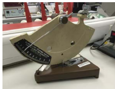
Fig. 5 Elmendorf tearing tester

In the tensile strength test (ASTM D5034 – 09), a 100 mm wide specimen was mounted centrally in clamps of the tensile testing machine (Instron 4411) and a force was applied until the specimen broke. Values for breaking force were obtained from the computer connected.