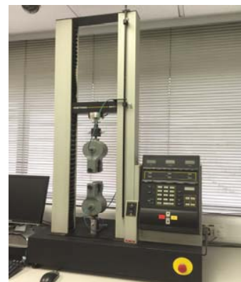
Fig. 4 Instron 4411

The tensile strength and tearing strength of the fabrics were measured in accordance with the ASTM D5034 – 09 (Standard test Method for Breaking Strength and Elongation of Textile Fabric (Grab Test)) (using Instron 4411) (Fig. 4) and ASTM D1424 – 09 (Standard Test Method for Tearing Strength of Fabric by Falling-Pendulum (Elmendorf-Type) Apparatus) (using Elmendorf Tearing Tester) (Fig. 5) respectively.